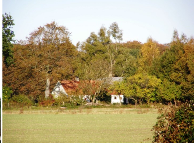
Views from the road of Aagard taken in 1996 across sugar beet field and #15 further north on Slibestenenevej taken in 2009.