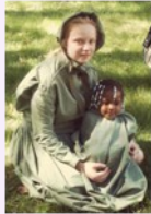
Meet the Fosters at Liberty Farm