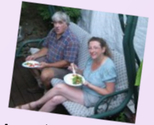
Annual Steering Committee Cookout in August