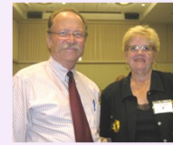
WWHP hosts Belarus delegation Aug 16

Tuesday, December 11, 5:30pm, VOICES FROM VIETNAM (See p4) by Worcester Women's Oral History Project at Worcester Public Library.